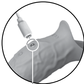
Magnetic charging port