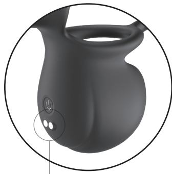
Magnetic charging port