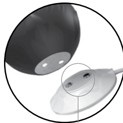
Magnetic charging base