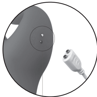
Magnetic USB charging port